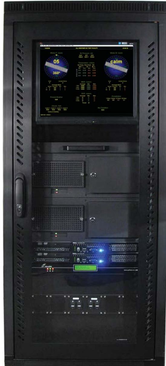
CDP Rack with Dual "Hot-swap" CDPs & GPS Time Synchronization options